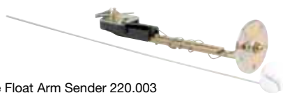
Adjustable Float Arm Sender 220.003