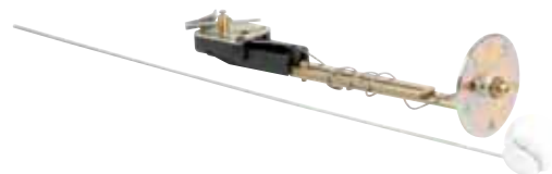
Adjustable Float Arm Sender 220.003