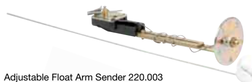
Adjustable Float Arm Sender 220.003

Note: Mounting kit part no. N05801432 not included in kit.