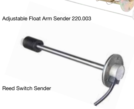
Reed Switch Sender

Just for 3 - 180 ohms gauges. See complete listing of reed switch senders on page 81. Note: Mounting kit part no. N05801432 not included in kit.