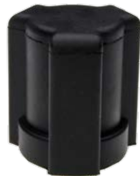
Protective rubber boot PN: 330.100